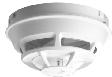
Model HI921 Thermal (Heat) Detector

Each Model HI921 detector has seven (7) pre-programmed parameter sets that can be selected by the Siemens FACP.